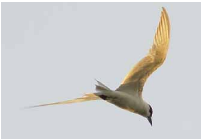
Figure 1. Individual of Gelocheidon nilotica observed at Bahía Ceuta in Sinaloa, México.

Bahía Ceuta (24° 06' to 24° 15' N and 107° 11' to 107° 24' W) is a large coastal lagoon in Central Sinaloa, that covers about 50 hectares of saltflats, which was formerly used for salt production (Figure 2). The area supports a large colony of breeding Least Terns (average of about 170 nests during the last 5 years) and Snowy Plovers ( Charadrius alexandrinus , average of about 30 nests during 3 years, Muñoz del Viejo and Vega, 2002). Ceuta was recognized as an important site under the Western Hemisphere Shorebird Reserve Network and has been declared a nesting preserve for sea turtles (especially Olive Ridleys, Lepidochelys olivacea ) by the government of Mexico.